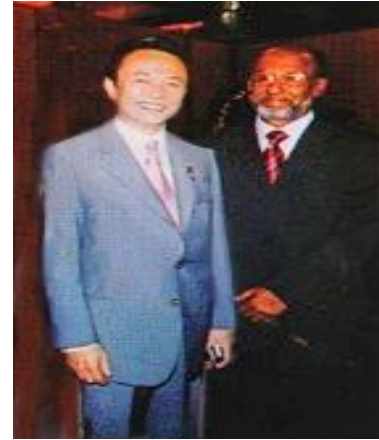
Pic: With former Hon. Prime Minister of Japan, Mr. Shinzō Abe (Left) and his successor, Hon Prime Minister of Japan, Mr. Tarō Asō, during their respective visits in Bangladesh as a leading dignitary representing Japan Bangladesh Chamber of Commerce and Industry (JBCCI).