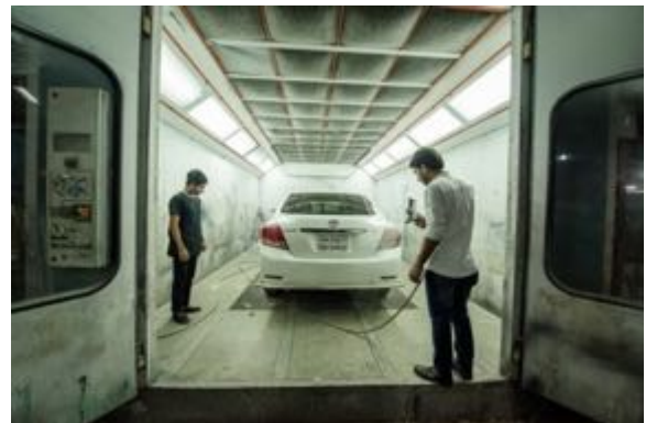
Paint work ongoing in fully equipped paint booth

No single automotive trader in Bangladesh has such comprehensive workshop and support engineering facilities at one place, which will cater all the technical needs of the customers. This facility is now being considered to be expanded and optimally used for other commercial/Industrial operations, like reconditioning of automotive vehicles, using the bonded house concept. Haq's Bay is also