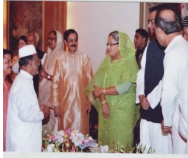
Pic: Exchanging pleasantries with the Hon. Prime Minister of Bangladesh, Sheikh Hasina